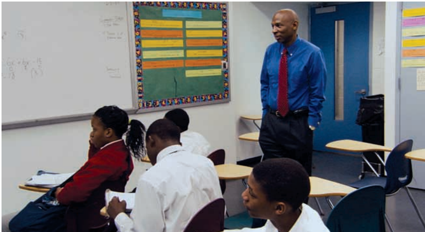
Geoffrey Canada (standing) with students.

Comprehensive programs for middle grades and high schools that combine research, a standards-based curriculum and extensive professional development to create positive and challenging learning environments. Both programs are run out of the Center for Social Organization of Schools at Johns Hopkins University.