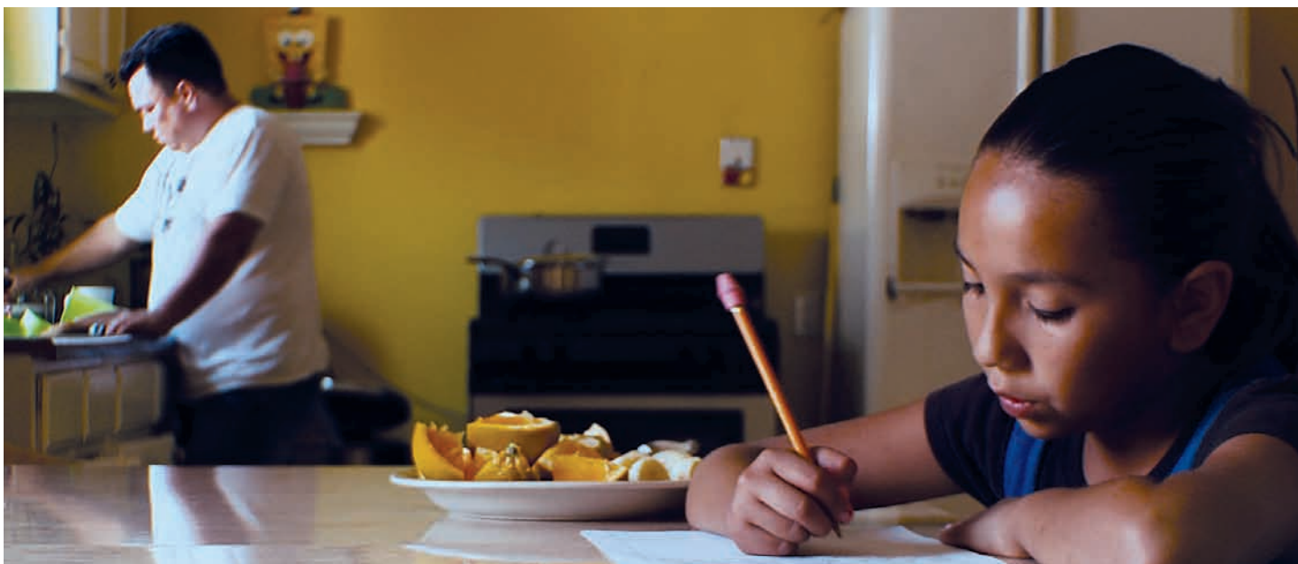
Daisy (right) and her dad.